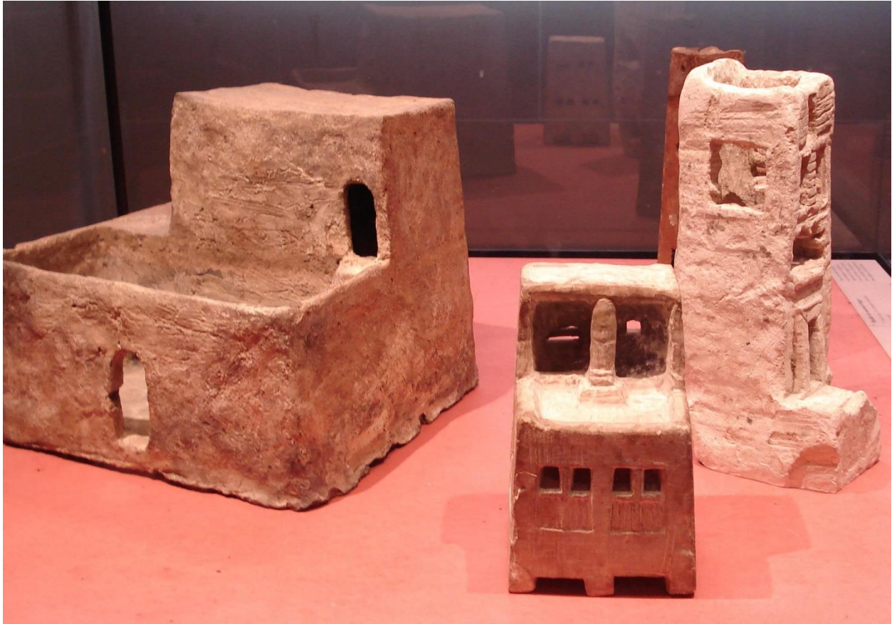
(models of ancient Egyptian homes in the Louvre Museum)

And as for the homes themselves, women owned homes... not men. The fact is, due to high infant mortality rates and to keep populations thriving, it was critical for men to maintain multiple families, yes, with multiple wives. This left men to go from home to home, meaning that women have always been "head of household" -- not men. It also means that when a home was designed and built, it was the women who determined the design and construction. This was likely the case for millions of years.