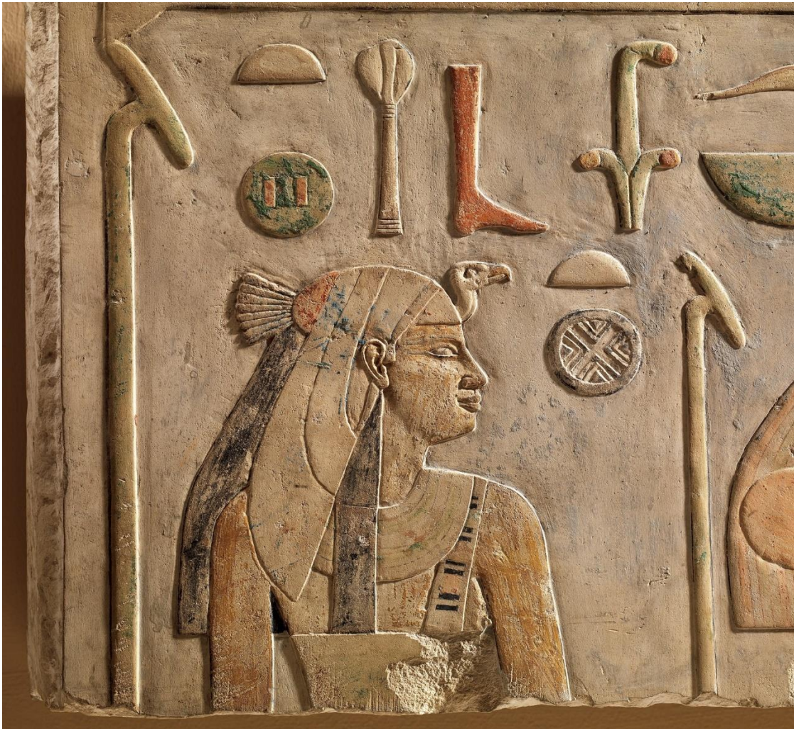
(Photo: Rogers Fund, 1908 - Megabit/Nekhbet developer of Egypt's first urban commercial center )

And who is attributed to the first urban ancient Egyptian commerce center? Her name is Megabit (Egyptologists: Nekhbet), a name whose root word, megbi , means "food." Yes, here again, as women for millions of years were the primary merchants of produce and goods in marketplaces, they were naturally in the position of first developing urban centers, which they did in ancient Egypt. Egyptologists attribute Megabit with ancient Egypt's first city, Megbi , (Egyptologists: Nekheb), the "City of Food."